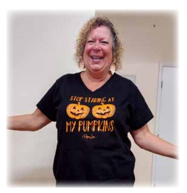
This t-shirt says it all... Stop Staring at My Pumpkins